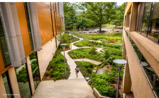
University of the District of Columbia Washington, DC

Washington, DC Washington, DC St. Elizabeths, DC Washington, DC Washington, DC West Virginia New Carrollton, MD