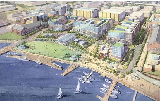
The Yards Washington, DC