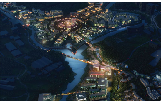
Smart City Kochi Kochi, India

Washington, DC Silver Spring, MD Silver Spring, MD Crystal City, VA Fort Belvoir, VA St. Elizabeths, DC Annapolis, MD Washington, DC Washington, DC Washington, DC Washington, DC