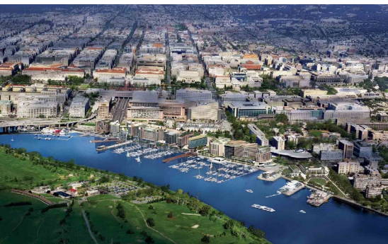
The Wharf Waterfront, Washington, DC