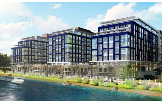
1900 Half Street/Buzzard Point Riverwalk Washington, DC