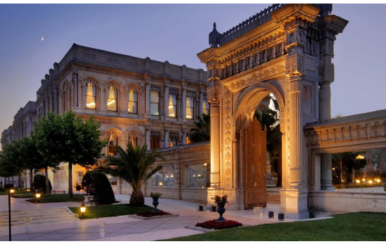
Ciragan Palace Istanbul, Turkey